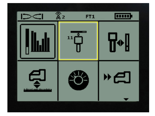
Two clicks to scan, and pair, with new Quick Scan Pair (QSP) feature

limited to using only one frequency at a time while drilling. Sidestep active interference with new V2 Dual-Power capability and give yourself an edge with lithium-ion transmitter batteries.