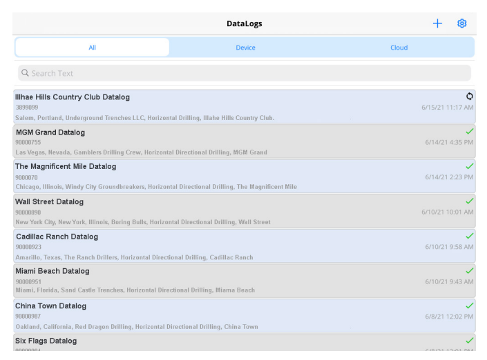
Easily find your jobs in the cloud or on your device